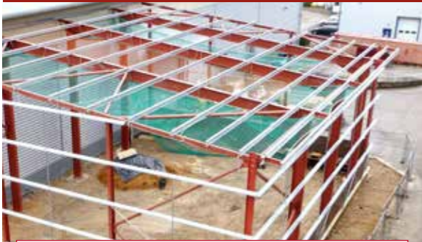
NGK Spark Plugs, Hemel Hempstead